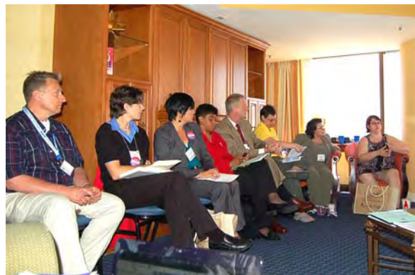
Division 44 Executive Committee Meeting