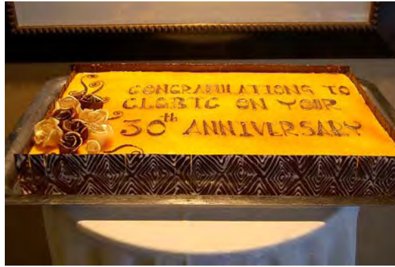
APA Committee on Lesbian, Gay, Bisexual, and Transgender Concerns (CLGBTC) 30 th Anniversary Cake